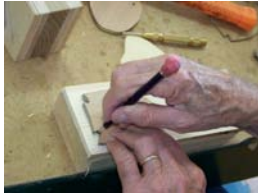
Now, draw an outline on a piece of wood.

It's easy...let me show you how. First go to the Alabama Woodworkers Guild web site and download some plans. Here, let me help you...click on this: http://www.alabamawoodworkersguild.org/toy%20plans/Toy%20Plans.pdf